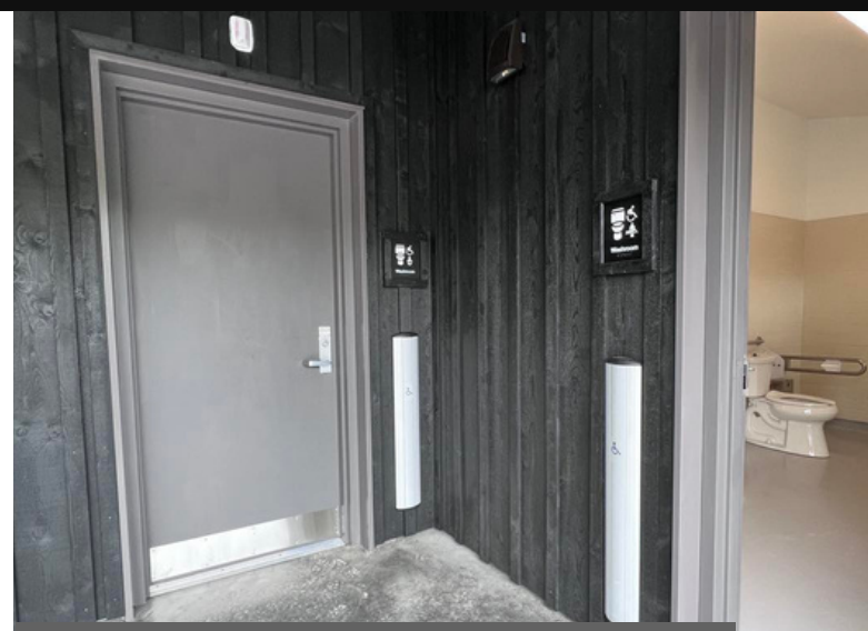
Accessible, gender-neutral washrooms

(ACOA) contributed $250,000 to support the construction of accessible and inclusive washrooms and changing stations at Aylesford Lake Public Beach. The Municipality of the County of Kings was awarded the funding through ACOA's Innovative Communities Fund, a program dedicated to increasing opportunities for economic development in Atlantic Canada. The improved amenities will make a trip to the Municipality's prime recreation destination in the summer months more enjoyable for beachgoers of all ages and abilities.